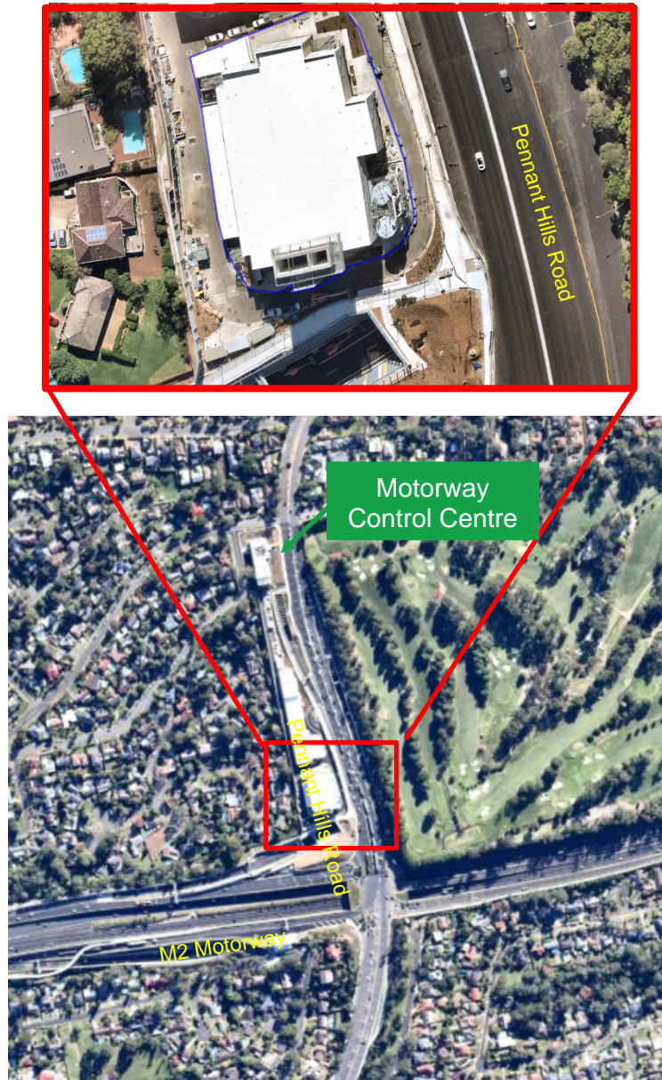
Figure 1: Southern Ventilation Outlet and Motorway Control Centre

Woonona Avenue, Wahroonga, NSW 2076 as pictured following. The broader location is shown in Appendix B –Location Map :