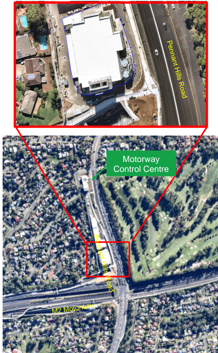
Figure 1: Southern Ventilation Outlet and Motorway Control Centre

Woonona Avenue, Wahroonga, NSW 2076 as pictured following. The broader location is shown in Appendix B –Location Map :