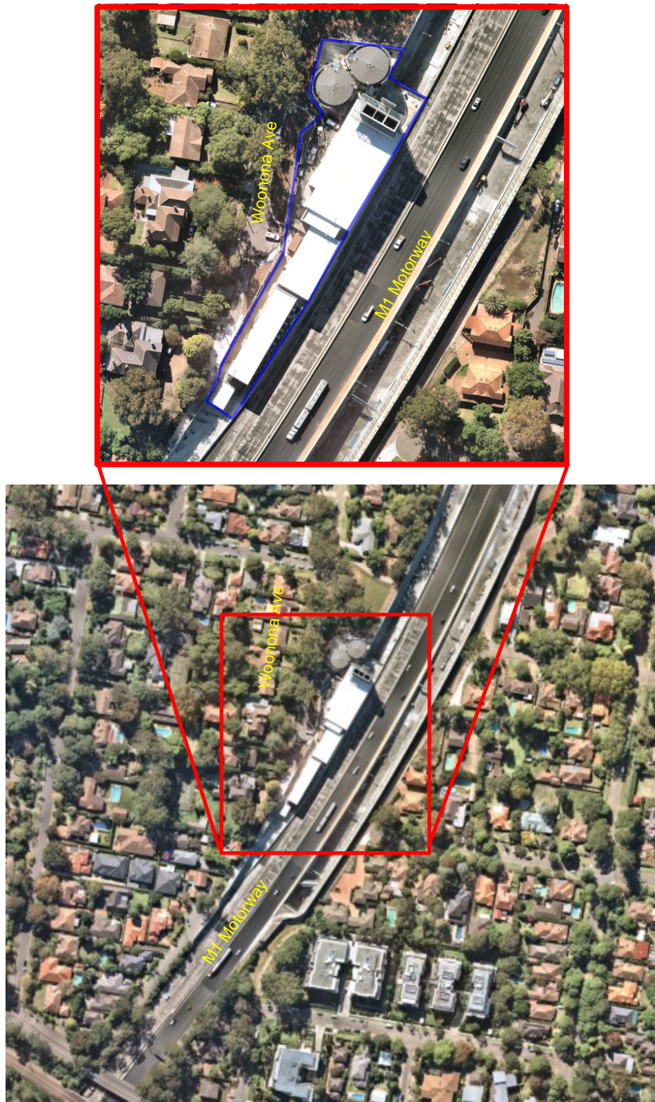
Figure 2: Northern Ventilation Outlet